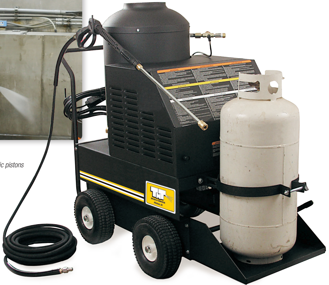
DH-1502-LP2E1A (tank shown not included)