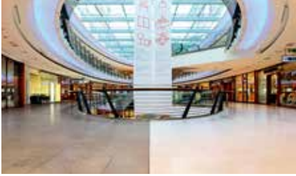
Building Service Contractors