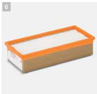
6 HEPA-level filtration