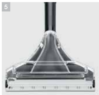
5 Flexible floor nozzle