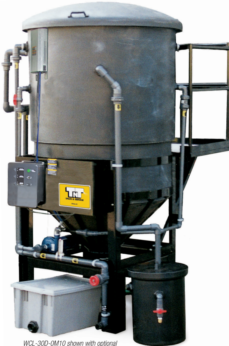
WCL-30D-0M10 shown with optional mezzanine stand (#RC-0005-0001)