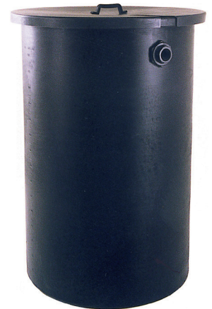
855-0016 optional 165-gallon storage tank